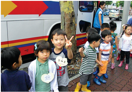
Visiting kindergarteners ham it up for the camera.

The next day at school, the children showed their appreciation to KAPES by holding a mini-fundraiser; they made dog puppets and sold them to raise funds for the Adoption and Education Center. We're thrilled the event made such an impact on those young students!