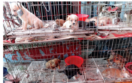
The sickly puppies that didn't make it despite KAMC's care.