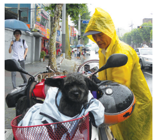
The poor man and his beloved pup.

I n the middle of monsoon season, KAPES' Korean Animal Medical Center received a visit from an old man and his little, black dog. He told the staff his story tentatively and with great care: he was a poor man, scraping by with the money he made collecting and selling recyclable material. With his paltry income, he could barely afford to feed his pet dog, let alone pay to have her spayed. Because she hadn't been fixed, she'd already had two litters, and he'd done what he could to find her pups homes. But the expense and effort of handling a third litter would be too much for him, so he'd come to KAPES to ask if they'd spay his dog for free. The staff was so impressed by his large-heartedness that they agreed. On top of spaying the pup, KAMC gave her a full check-up and medication for free. The man was so grateful for KAPES' services that he pledged a $5 monthly donation despite his small income.