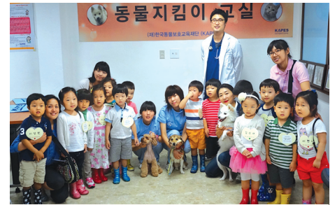
The next generation of animal protection activists!

One highlight of the event was a humanizing lesson by KAMC's head vet: he offered his stethoscope to the children to listen to rescues' heartbeats, then asked the students to make a comparison with their own. Each child who listened was intrigued by the similarities in the heartbeats. This simple exercise was a powerful lesson in sympathy and compassion.