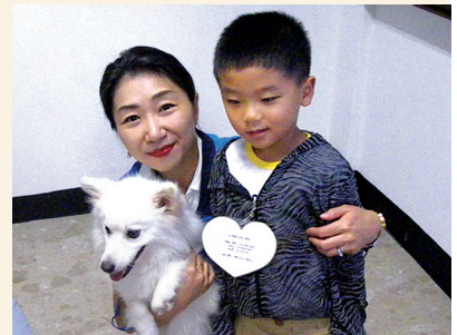
KAPES is teaching the next generation to respect and love their animal friends.

One of new law's major shortfalls is its failure to outlaw the dog and cat meat industries. Though the new amendments are said to be inspired, in part, by animal rights protests against the dog meat industry, the MIFAFF still omitted the criminalization of companion animal farming