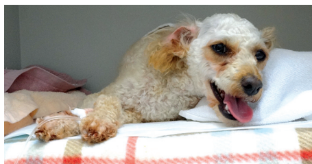
Yangpa recovering after surgery at KAPES' clinic.

help. At the KAMC, Yangpa bravely underwent a series of tests. Finally, one test yielded a diagnosis: Yangpa