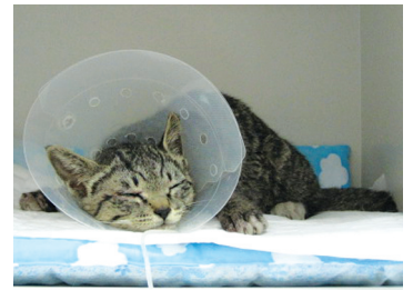
Kitty sleeping soundly after a tough day of treatment.