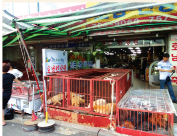
A Korean dog market scene.

"The revised law reflects the people's increasing concerns over the ill treatment of animals," the ministry stated. These new regulations have far-reaching implications, radically changing the country's treatment of pets, livestock, and lab animals.